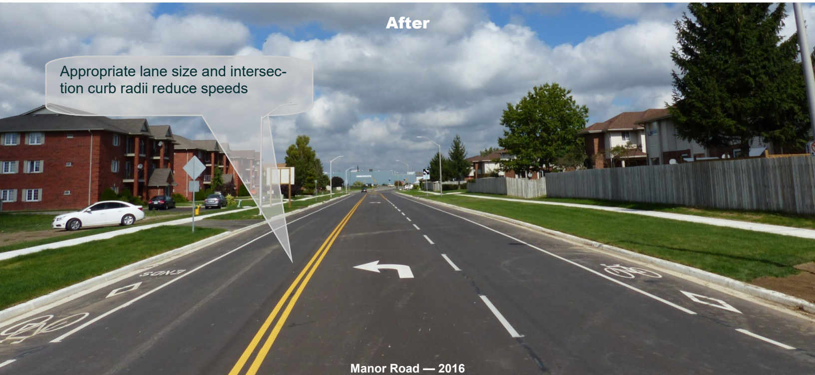
Manor Road — 2016

Appropriate lane size and intersection curb radii reduce speeds