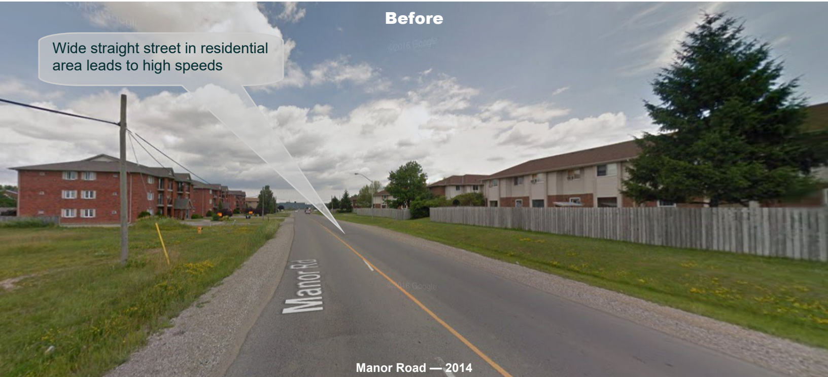
Manor Road — 2014

Wide straight street in residential area leads to high speeds